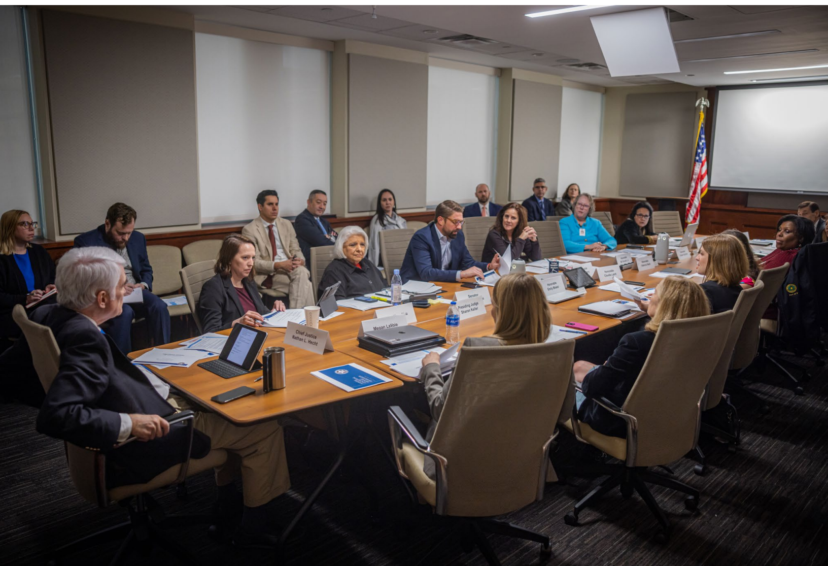
Texas Judicial Council meeting, February 24, 2023