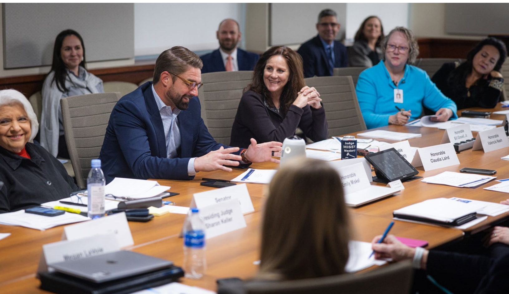
Texas Judicial Council meeting, February 24, 2023